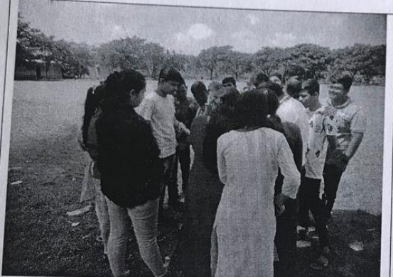
Students performing practicals on DGPS