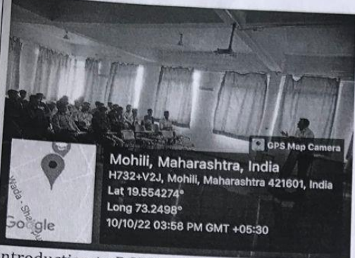
Introduction to DGPS and Hands on training