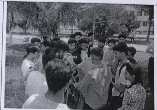
Students performing Practical on DGPS